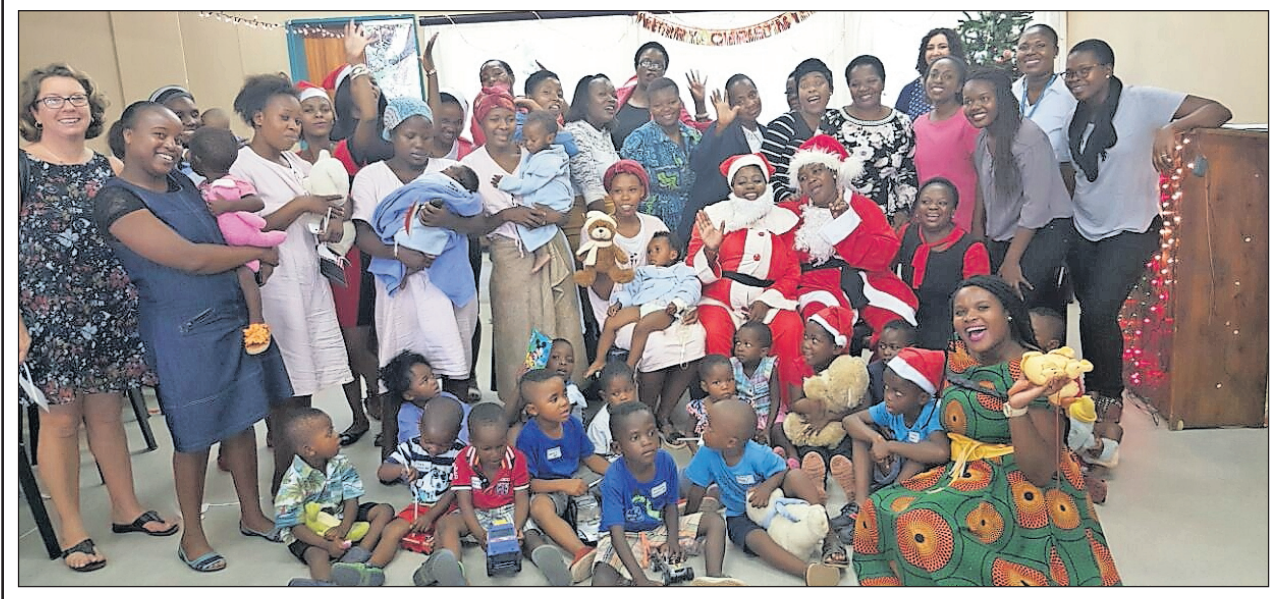
PARTY: Van Velden Hospital staff, children from Noah's Ark and children admitted at the hospital with their mothers.